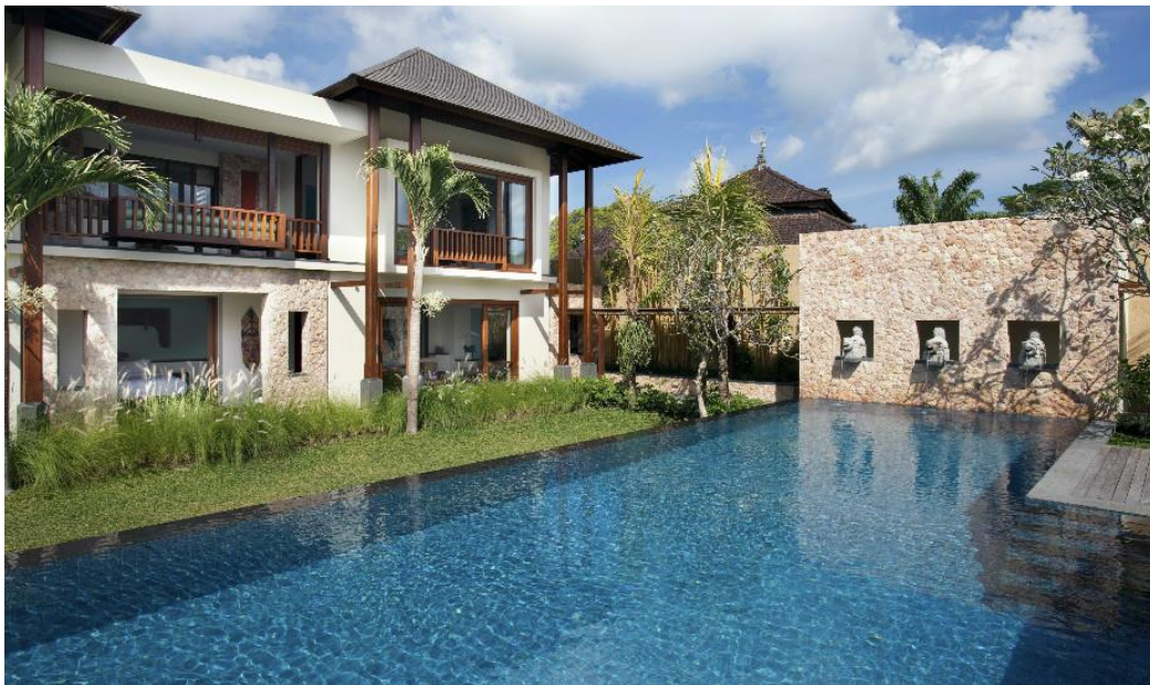
The gorgeous Villa Satria

Villa Shambala, Jalan Saritemuku No.8E, Gang Kahyangan, Seminyak. p. +62 (0) 361 737 498.