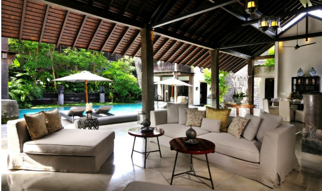
The open living room area