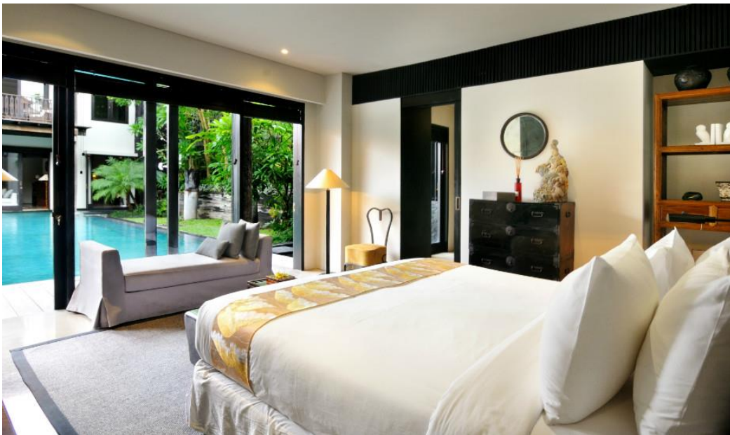
A bedroom with pool view