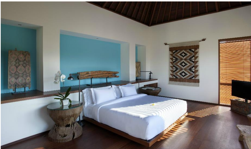
One of the bedrooms