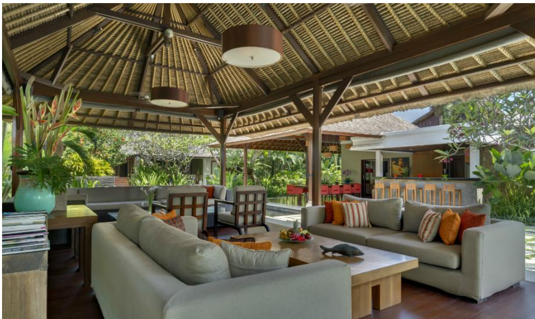
The living area of Villa Asta

Villa Satria, Jalan Petitenget 1000X, Seminyak. p. +62 (0) 361 737 498.