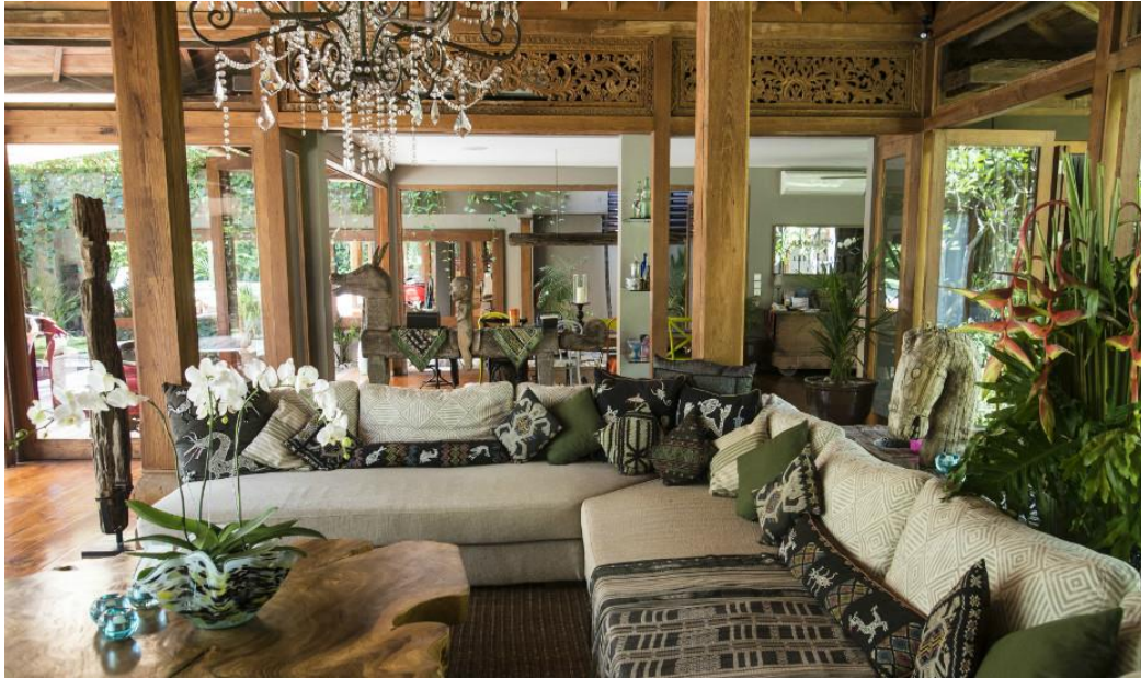
The villa has stunning interiors