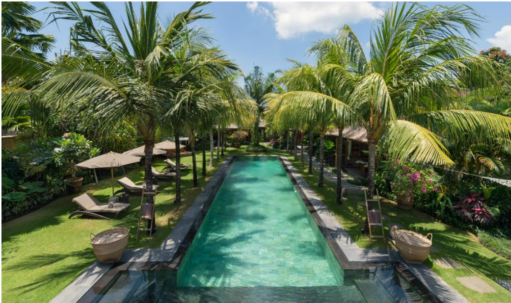
The long azure pool