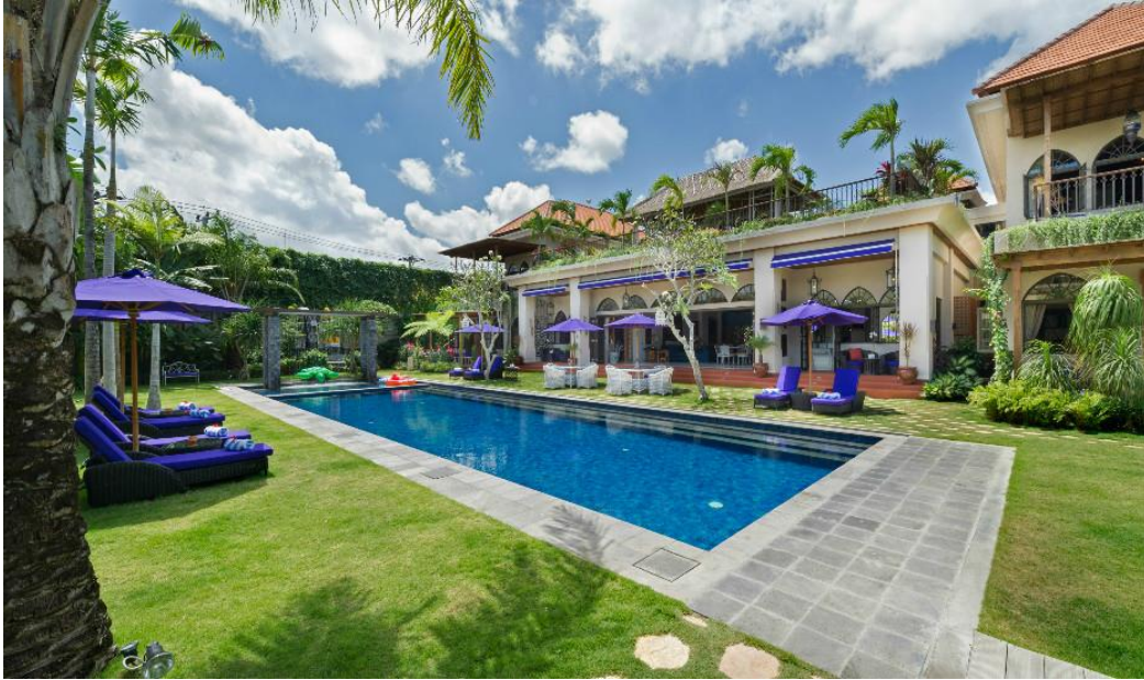
The beautiful Villa Sayang d'amour