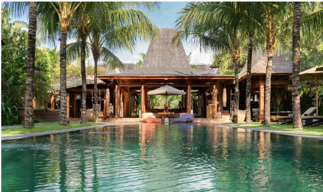
Villa Shambala is the ultimate place to relax

If you are looking for a plush pad to host an epic beachfront wedding, an intimate birthday party, or you are looking for a luxe tropical escape, then read on! These fabulous Seminyak villas provide luxurious living, right in the mix of this exciting and bustling town. Only a short stroll to the sandy beach, minutes from hordes of boutique shops, with world-class restaurants and cafes on your doorstep, these villas are the perfect place to spend your holiday. Choosing which one is the only hard part!