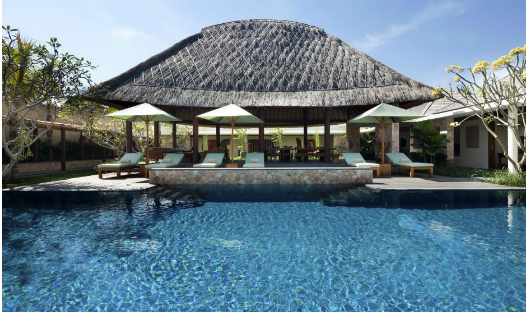
The stunning pool are with sunbeds