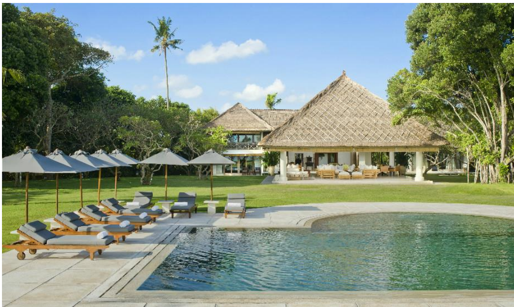
Villa Atas Ombak has an expansive garden and pool area

Villa Asta, Gang Gelatik No.8, Kerobokan. p. +62 (0) 361 737 498.