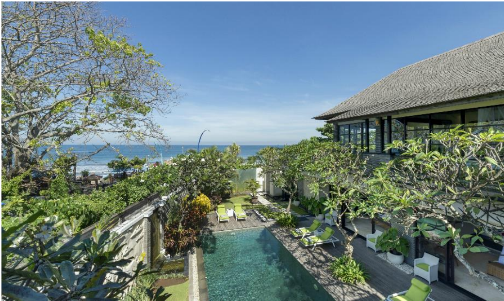
The ocean view