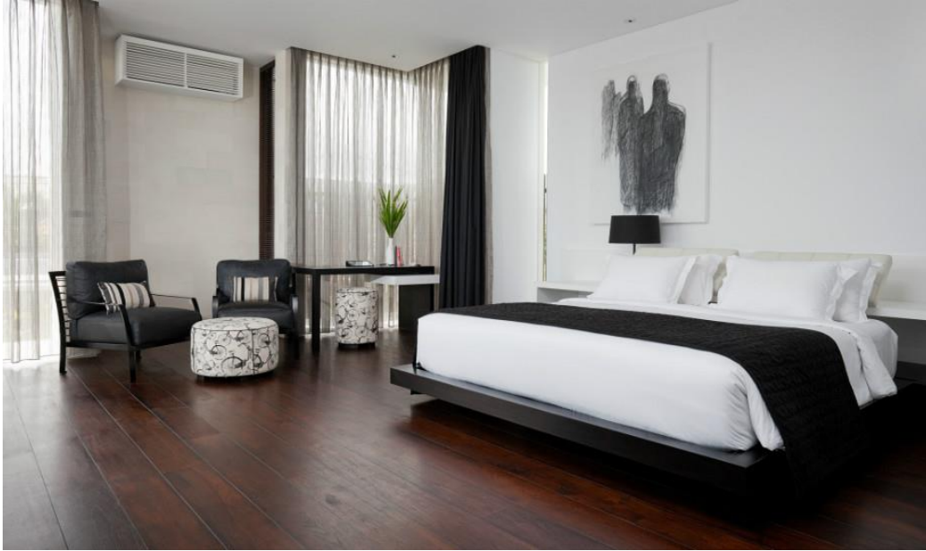
The master bedroom