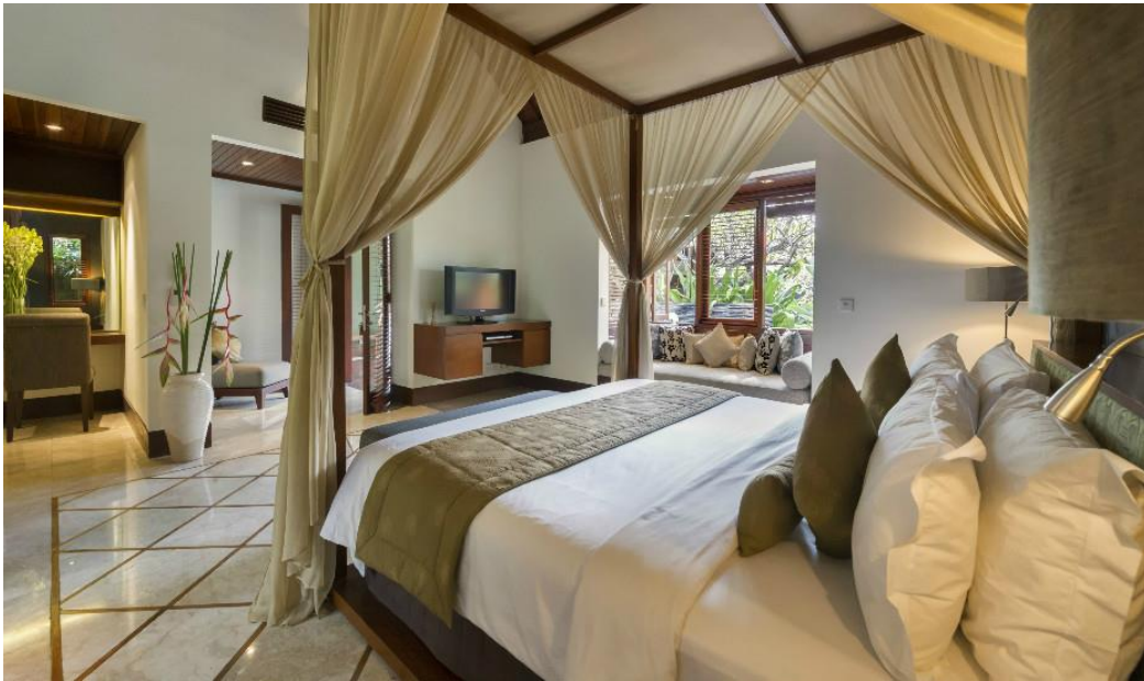
The gorgeous four poster bed