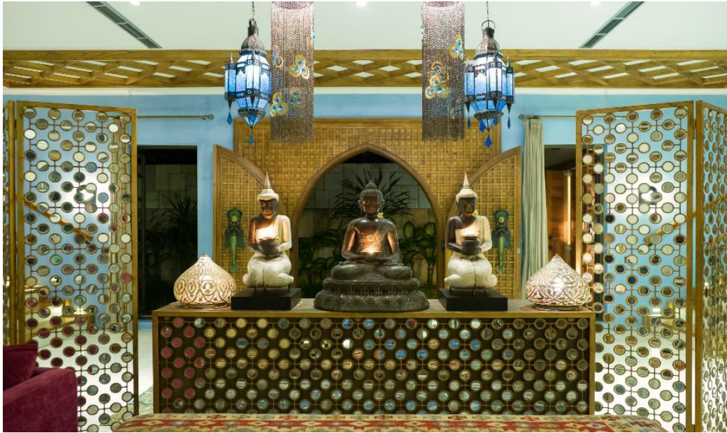
The stunning buddha decorations