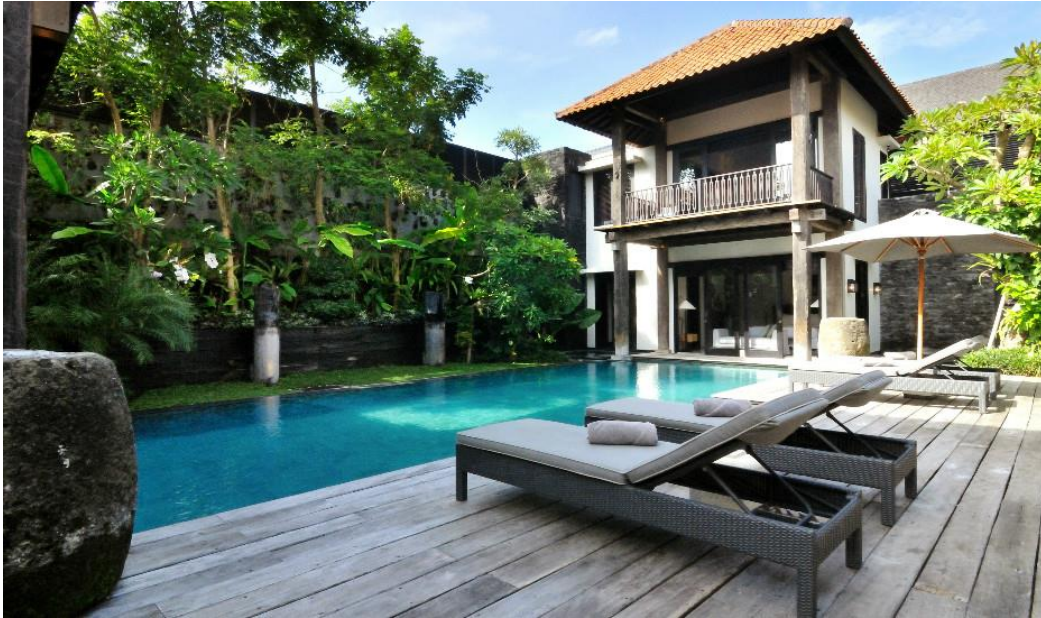
Villa De Suma has a great pool area