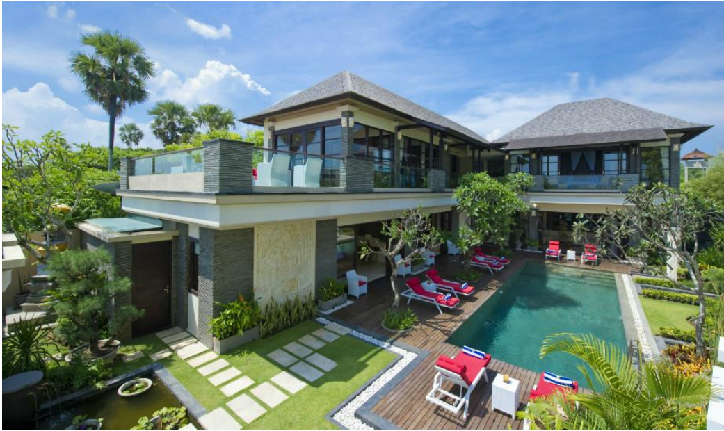
The beautiful Villa Lega