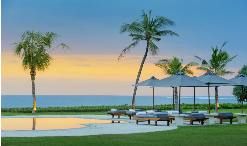
The pool area as the sun goes down