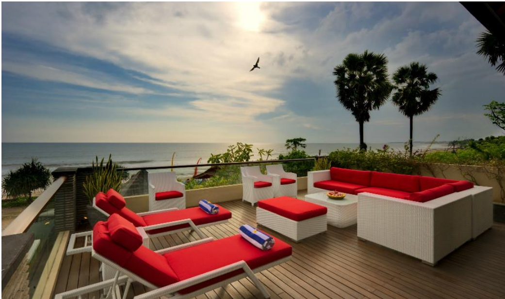
The rooftop area