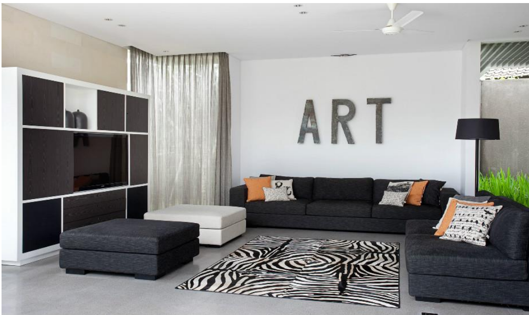
We love the modern and funky décor