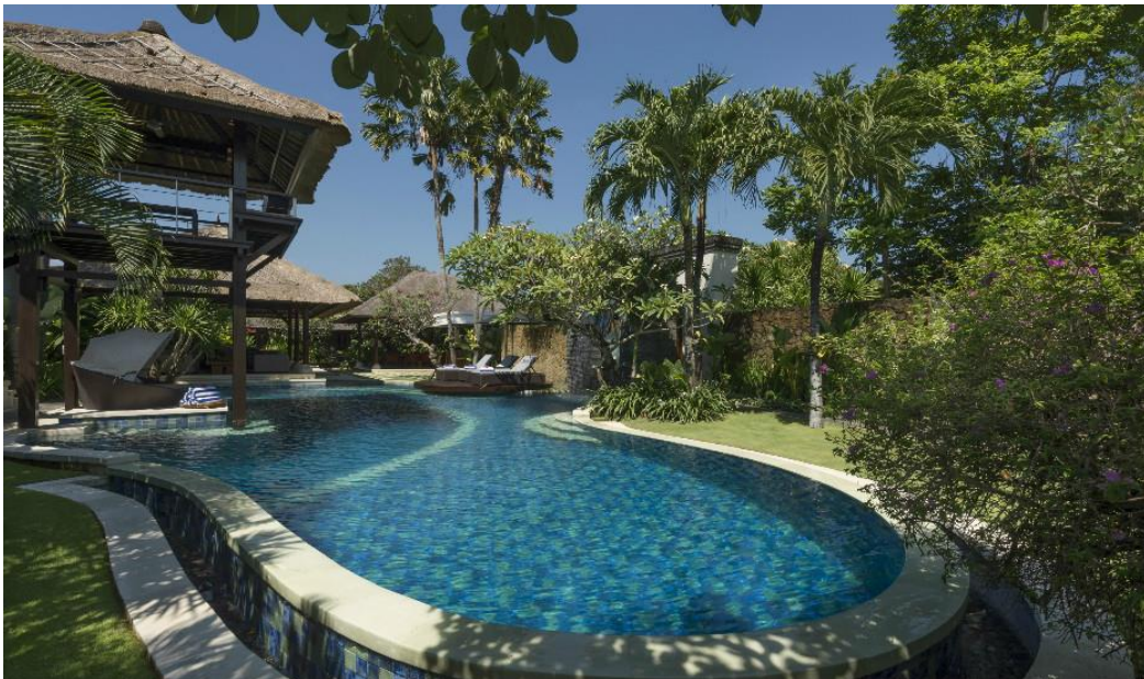
The curved swimming pool