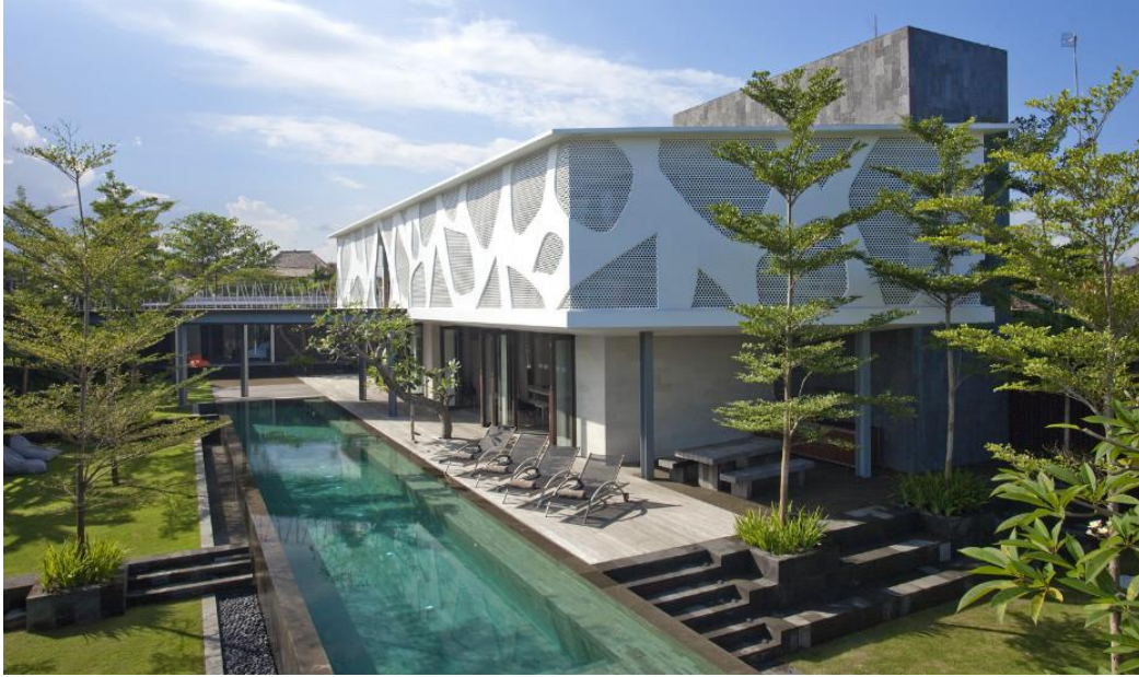
Villa Issi with its large pool